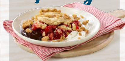
TRAVERSE CHERRY AMARETTO BOWL