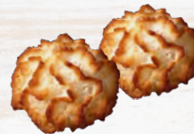
topped with bits of coconut macaroon cookies