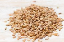
topped with toasted sesame seeds