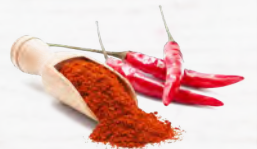
topped with pineapples, brown sugar and spicy cayenne pepper

USE creative names TO OVERCOME younger consumer's OBJECTION THAT PIE IS NOT COOL