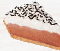
a slice of Chocolate Cream Pie shower of chocolate sprinkles