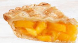
Our famous Peach Hi-Pie filled with Ripe Michigan or California peaches