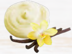
nestled in Vanilla yogurt