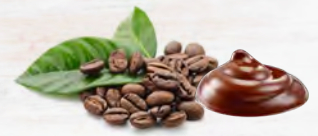
upgrade with chocolate espresso sauce