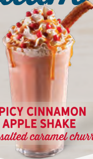
SPICY CINNAMON APPLE SHAKE with salted caramel churro