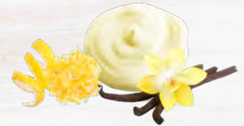
nestled in lemon zest vanilla yogurt