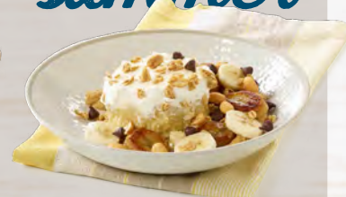
BANANA CREME DA LA CREME BOWL