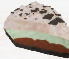
a scoop of Chocolate Mint Cream Layer Pie