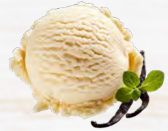
paired with Vanilla bean ice cream