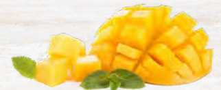
garnished with Sweet mango mint salsa

Click on recipe name to get full recipe card