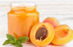
infused crust with apricot preserve