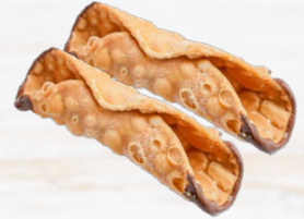
Chocolate-dipped cannoli shells