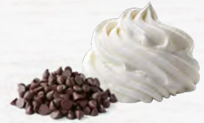
garnished with chocolate chips and whipped topping

CHECK OUT OUR deCONSTRUCTED PIE Culinary Video