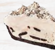
a slice of Crème de la Cream Cookies & Cream Pie