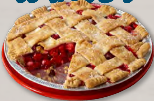
MARSHMALLOW CHOCOLATE CHIP CHERRY PIE