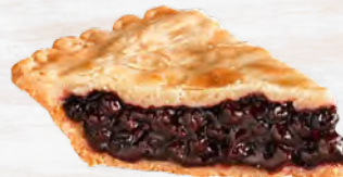
a scoop of Chef Pierre® Blueberry Hi-Pie