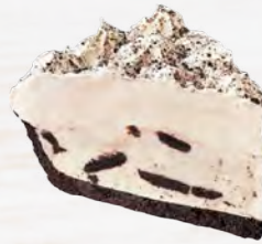
2 slices of Crème de la Cream Cookies & Cream Pie