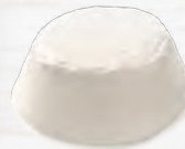
filled with ricotta-infused cookies & cream pie