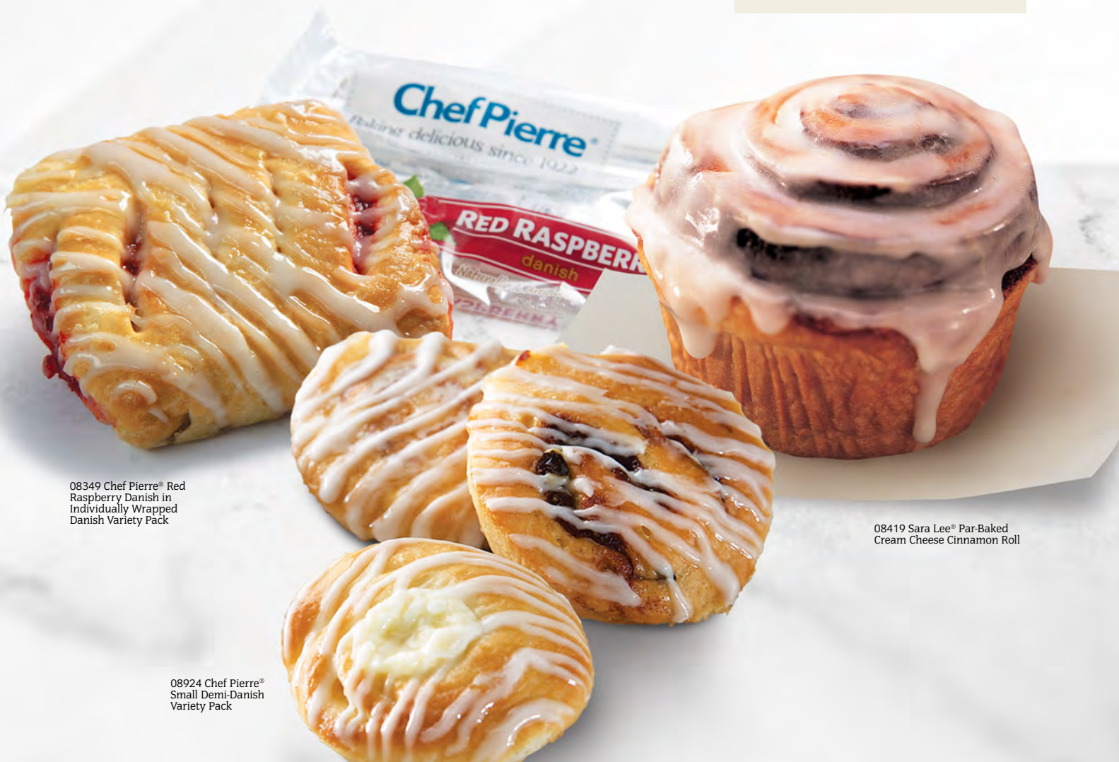
08349 Chef Pierre® Red Raspberry Danish in Individually Wrapped Danish Variety Pack

PAIRS PERFECTLY WITH A BEVERAGE FOR BREAKFAST OR AS AN ALL-DAY SNACK