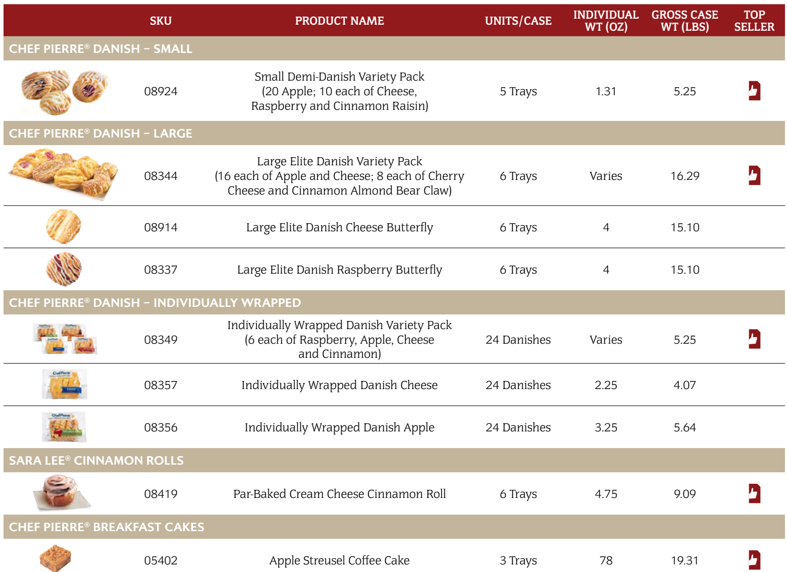
08419 Sara Lee® Par-Baked Cream Cheese Cinnamon Roll

We're here to make your life a little sweeter